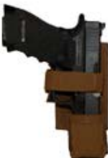
Universal Holster ATS-6979