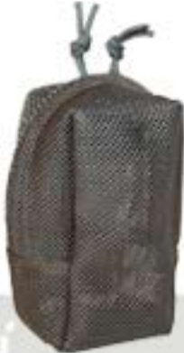
Mini GP Pouch ATS-0199