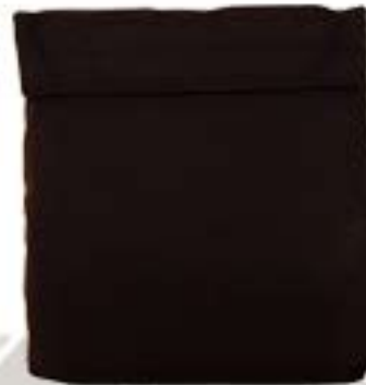
iPad Case ATS-6974