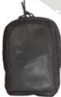
Half IV Pouch ATS-6975