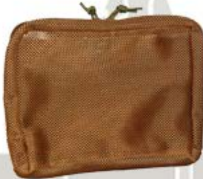
CAP Stash Pocket ATS-0198