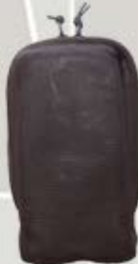
Full IV Pouch ATS-6976