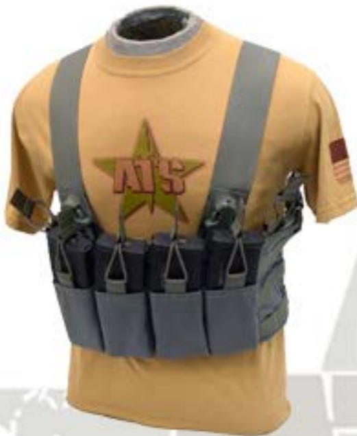
5.56 Slimline Chest Harness