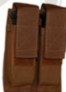
Double Pistol Mag Pouch ATS-6980