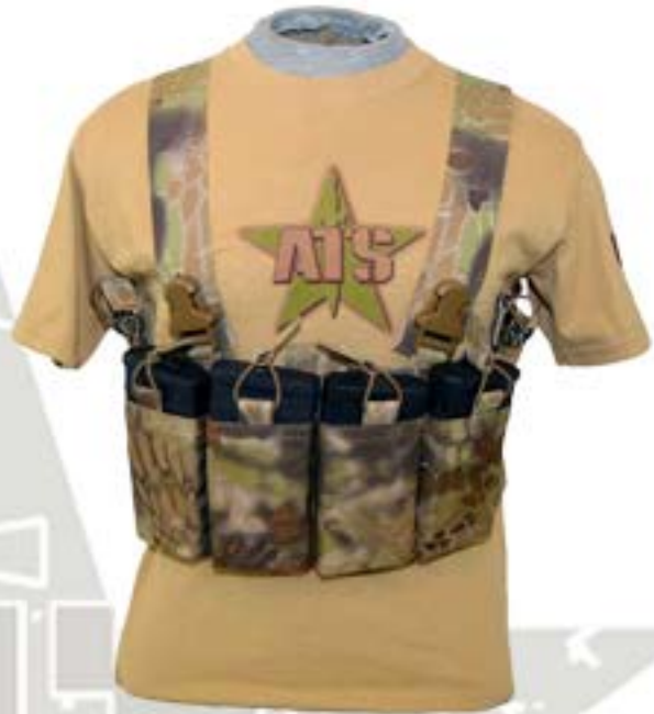
7.62 Slimline Chest Harness