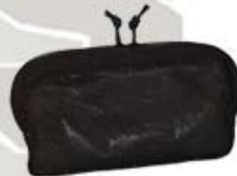
Horizontal Full IV Pouch ATS-6978